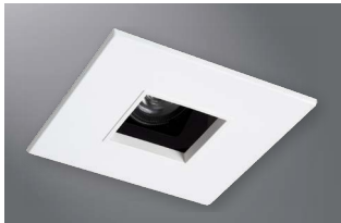
1485 Square Pinhole w/Oculus, Open, 35° tilt