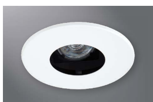
1444 Round Pinhole, Open, 35° tilt