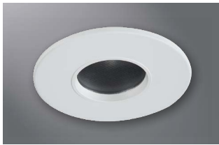
1447 Round Pinhole, Diffuse Lens, 35° tilt