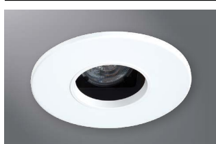
1445 Round Pinhole with Oculus, Open, 35° tilt