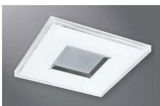
1489 Square "All Acrylic-Glass", Diffuse Lens, 35° tilt