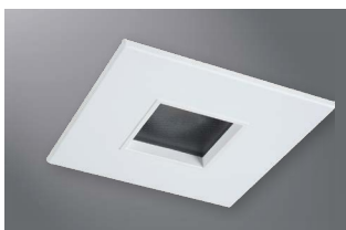
1487 Square Pinhole, Diffuse Lens, 35° tilt