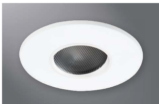
1446 Round Pinhole, Lens Wall Wash