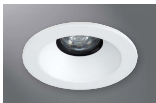
1440 Conical Reflector, Open, 35° tilt