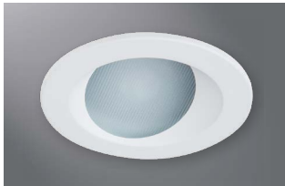
1442 Angle Cut Conical Reflector, Lens Wall Wash