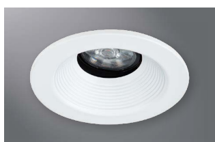
1441 Conical Baffle, Open, 35° tilt