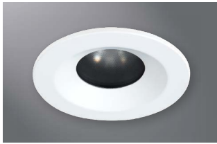
1443 Conical Reflector, Diffuse Lens, 35° tilt