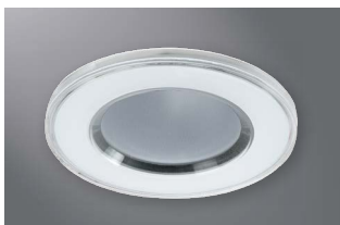
1449 Round "All Acrylic-Glass", Diffuse Lens, 35° tilt