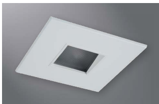
1486 Square Pinhole, Lens Wall Wash