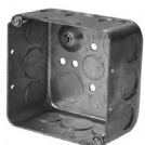
4" square deep steel box 4" x 4" x 2-1/8" (102mm x 102mm x 54mm)