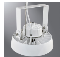
SMB Surface Mount Bracket