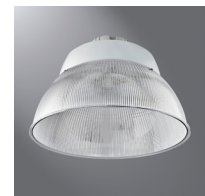
CLR Clear Reflector