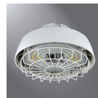
WG Wire Guard