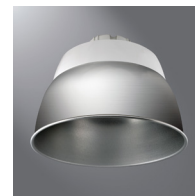
ALR Aluminum Reflector