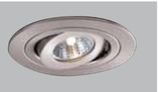
1495SN Satin Nickel Gimbal with Satin Nickel Trim