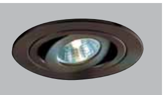
1495TBZ Tuscan Bronze Gimbal with Tuscan Bronze Trim Ring