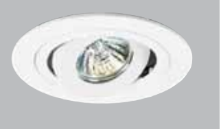
1495P White Gimbal with White Trim