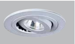
1495SL Silver Gimbal with Silver Trim