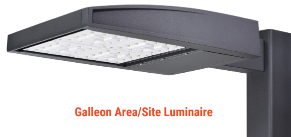
Galleon Area/Site Luminaire