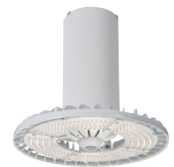
Metalux Steeler - SSLED High Bay LED