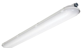
Metalux VT3 Vaportite LED