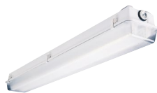
Metalux VT2 Vaportite LED