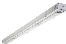
Metalux SNLED Striplight LED