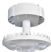
Metalux Benchmark - BMK High Bay LED