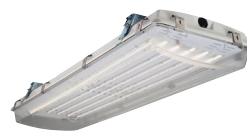
Metalux VT4 Vaportite LED